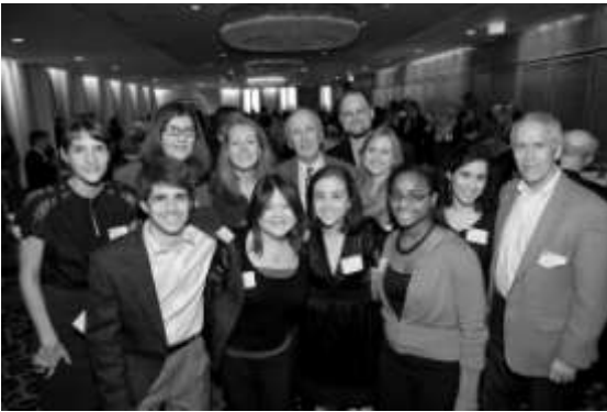
Chicago Area Committee members and volunteers